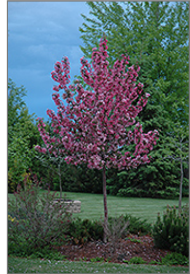
Rudolph Flowering Crab in bloom

Rudolph Flowering Crab is recommended for the following landscape applications;