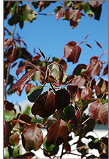
Rudolph Flowering Crab foliage

This tree should only be grown in full sunlight. It prefers to grow in average to moist conditions, and shouldn't be allowed to dry out. It is not particular as to soil type or pH. It is highly tolerant of urban pollution and will even thrive in inner city environments. This particular variety is an interspecific hybrid.