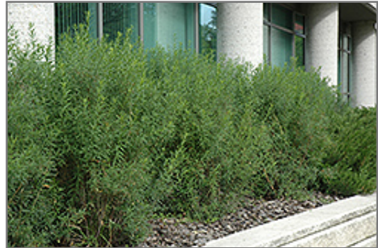
Dwarf Turkestan Burning Bush