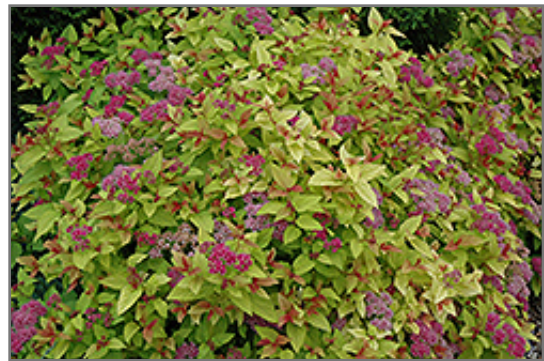
Magic Carpet Spirea flowers