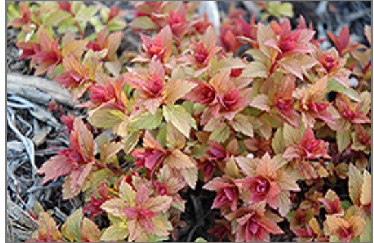
Magic Carpet Spirea foliage

This shrub should only be grown in full sunlight. It prefers to grow in average to moist conditions, and shouldn't be allowed to dry out. It is not particular as to soil type or pH. It is highly tolerant of urban pollution and will even thrive in inner city environments. This particular variety is an interspecific hybrid.