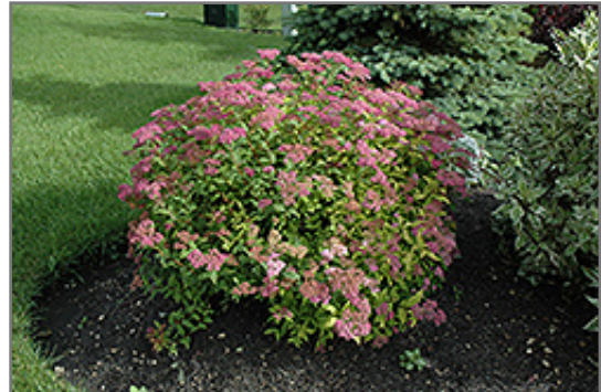
Goldflame Spirea in bloom