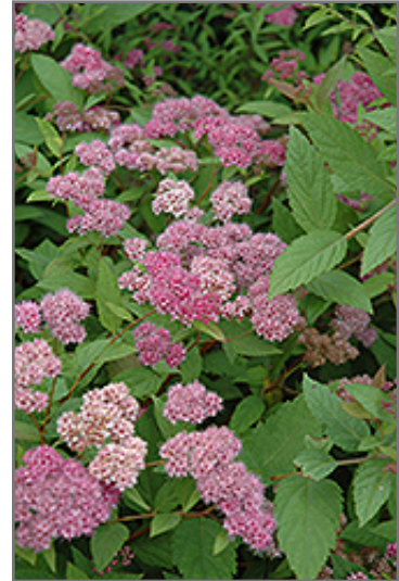
Froebelii Spirea flowers

This shrub will require occasional maintenance and upkeep, and is best pruned in late winter once the threat of extreme cold has passed. It is a good choice for attracting butterflies to your yard, but is not particularly attractive to deer who tend to leave it alone in favor of tastier treats. It has no significant negative characteristics.