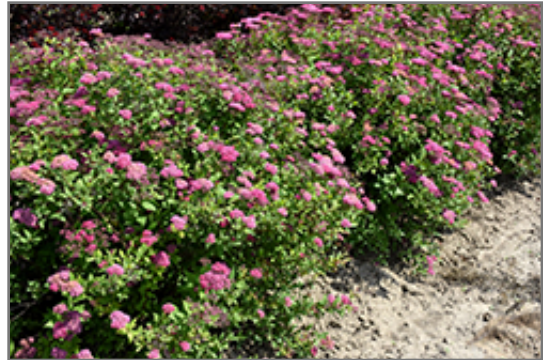
Froebelii Spirea in bloom