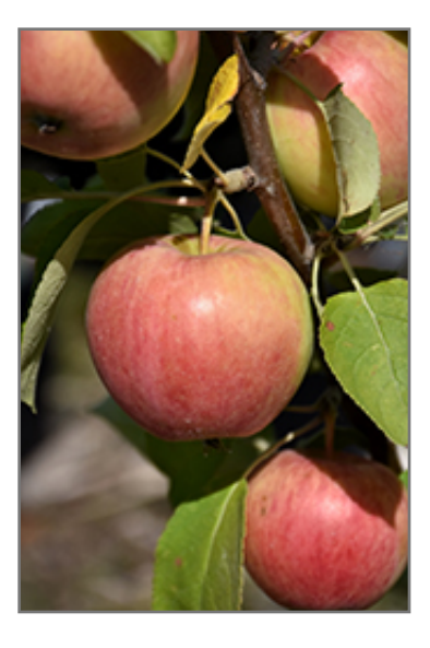
Gemini Apple fruit

24309 TWP RD 510 Beaumont, AB phone: 780-929-8102 web: cheyennetree.ca